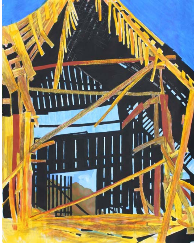
Blountville TN Barn in Yellow and Blue, 2009. 6.5 feet tall by 5 feet wide.

When all the wooden barns fall down, what will we have lost?